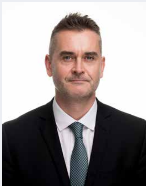
Edmund Burke Partner

Farms and rural businesses are Persons Conducting a Business or Undertaking for the purposes of the Work Health and Safety Act 2011 (Qld) and the Electrical Safety Act 2002 (the Acts).